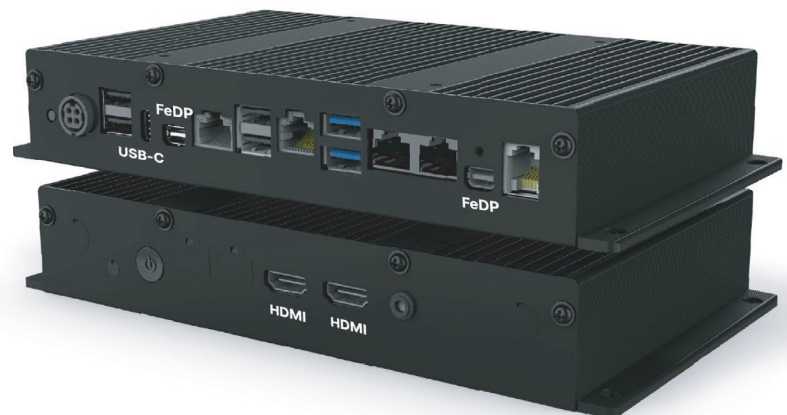
Front and Back View