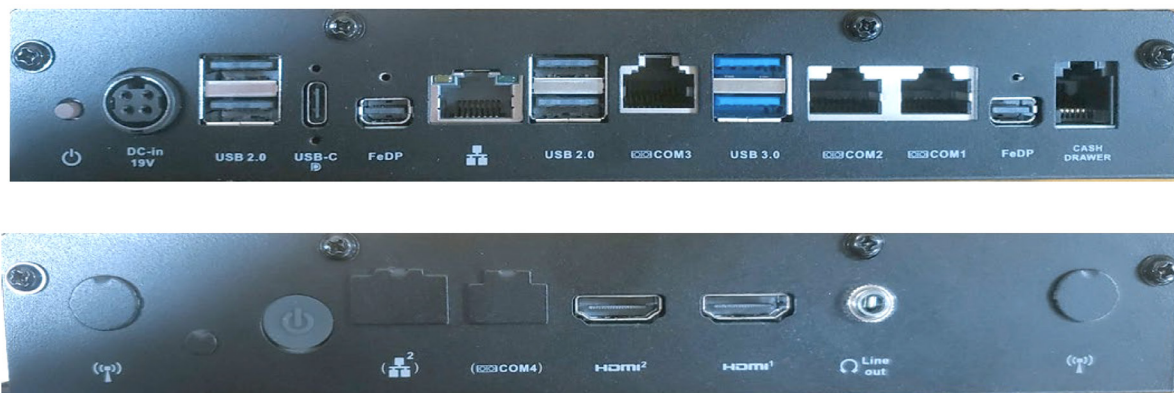
Front and Back View